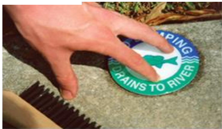
Stick adhesive to storm drain marker and STICK IT above the inlet.