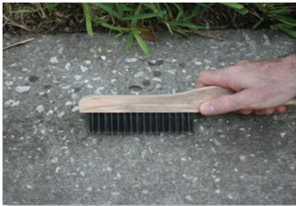
Optimum temperature is 40° F minimum to 90° Surface should be clean and dry