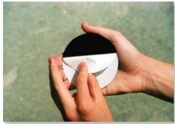
Peel backing from one side of the adhesive.