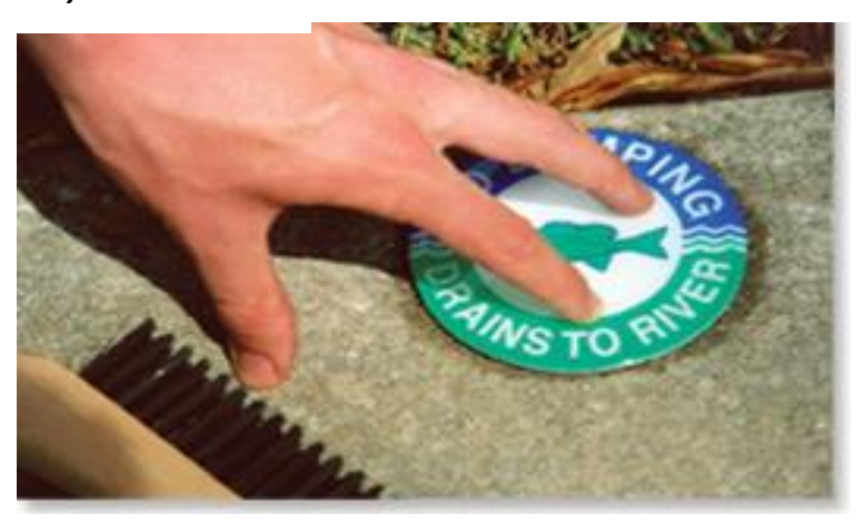
Stick adhesive to storm drain marker and STICK IT above the inlet.