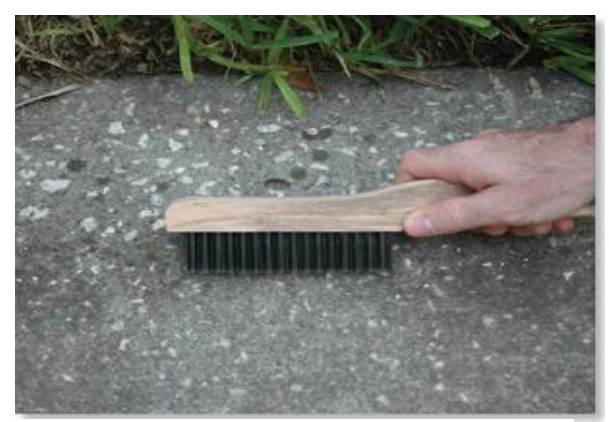
Optimum temperature is 40° F minimum to 90° Surface should be clean and dry

Neighborhoods, schools, churches, or any volunteer groups are encouraged to contact SEMSWA to set up an inlet labeling project in your area. It's as easy as 1-2-3!