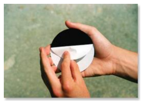
Peel backing from one side of the adhesive.